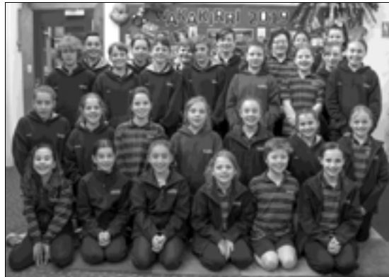
The Lobethal Lutheran School's 2019 award winning Wakakirri Story-Dance troop. The school won the State's Best Popular Culture Story Award and Best Hair & Makeup Award.

The performing arts are an outlet for the students at Lobethal Lutheran School. They provide opportunities to be creative, encouraging critical thinking, positive collaboration and confidence building. These skills transfer across all disciplines, blurring the old-fashioned lines of learning to inspire independent thinkers. Mrs