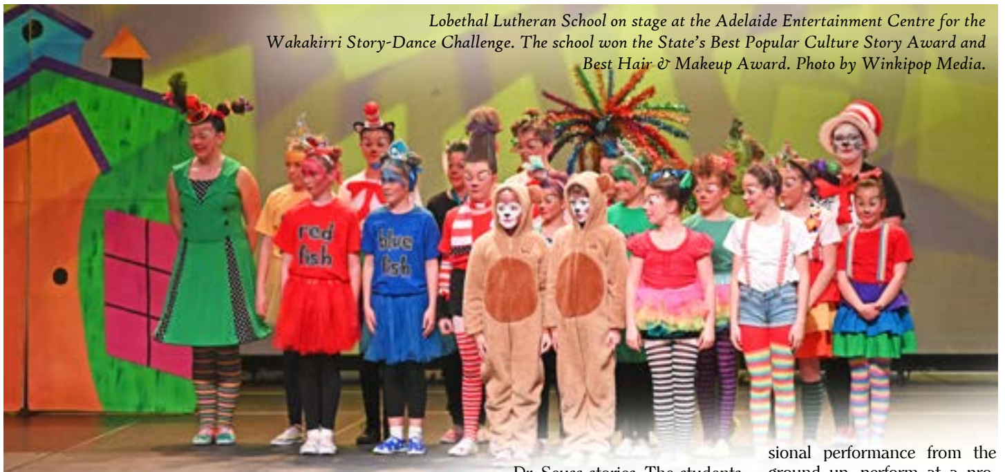
Lobethal Lutheran School on stage at the Adelaide Entertainment Centre for the Wakakirri Story-Dance Challenge. The school won the State's Best Popular Culture Story Award and Best Hair & Makeup Award.