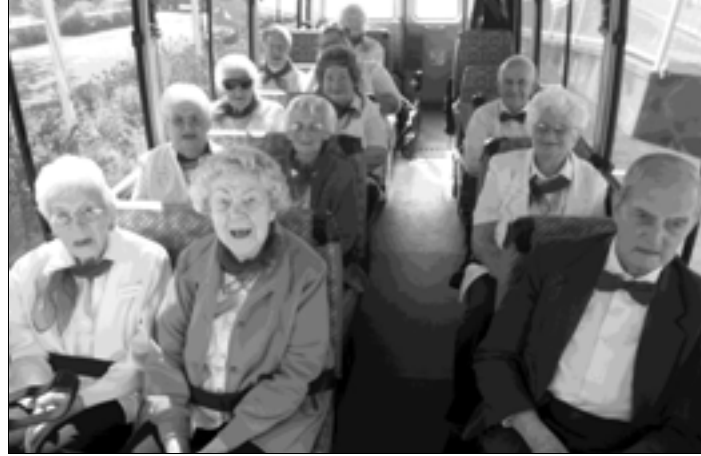
The Happy Songbirds choir on tour, running through vocal exercises on the bus in preparation for their performance at the Eldercare Sash Ferguson facility in Mount Barker.

choose songs from when they were young, they come to life when they hear the music.'