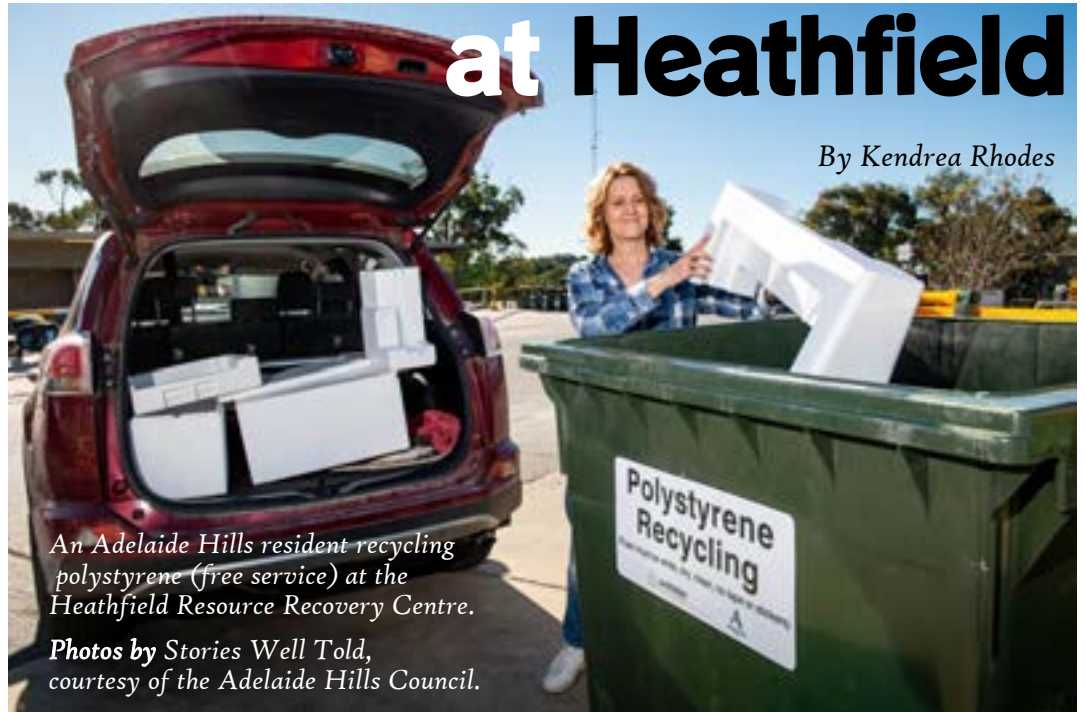
An Adelaide Hills resident recycling polystyrene (free service) at the Heathfield Resource Recovery Centre.