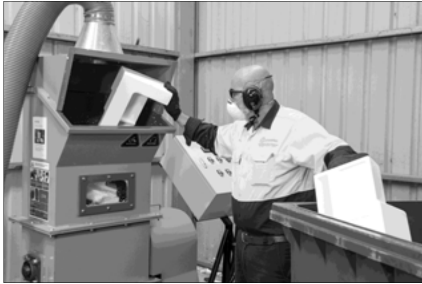
Staff from the Heathfield Resource Recycling Centre using the polystyrene melting machine to shred, melt and shape polystyrene into bricks that will be recycled into other products.

According to the fact sheet on expanded polystyrene from the Australian Government's National Plastics Plan, single use consumer plastics (such as expanded polystyrene loose fill packaging, and foam food and beverage containers) will be phased out because they cannot be recycled. Sadly, advice for these products at the moment is to put them in your blue landfill bin. Likewise, if you cannot take your recy-