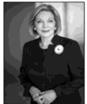
Ita Buttrose, AC, OBE

Being held Thursday July 15, 9am-1pm Cornerstone College in Mount Barker