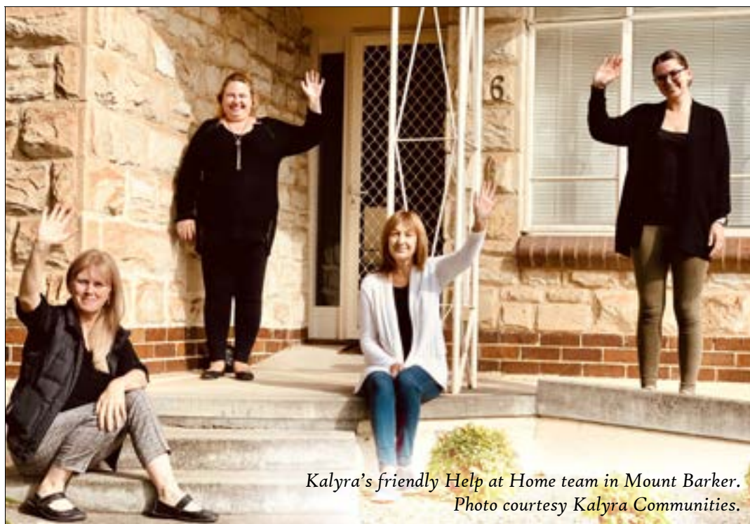
Kalyra's friendly Help at Home team in Mount Barker.

Kalyra Woodside Village contains 83 retirement homes and is an exciting addition to the district. It complements Kalyra's Help