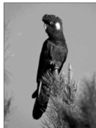
Yellow-tailed black cockatoo

You will learn about who is living in the hollows and how you can help the homeless wildlife by attending James talk "Hollow Habitats". To reserve your seat, register by emailing valhunt@ahnrc.org . The cost is by donation.