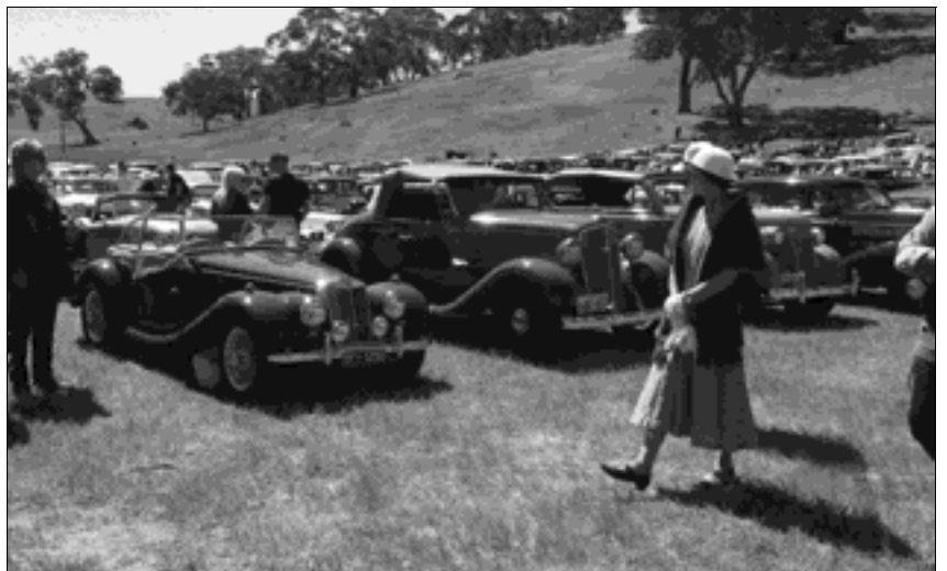
Images from the 2018 Bay to Birdwood Classic