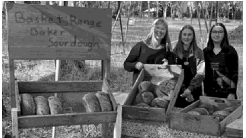
The Basket Range Bakers sold out at the Oakbank Hall's Saturday Market in February. They will be stocked up at the next market, 13 th March. Contact via Facebook or 0402 058 160.

S A T U R D A Y MARKETS - The need for community gathering was duly met at the