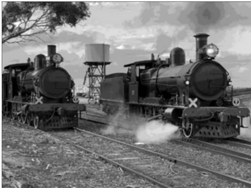
Freshly restored locomotive Rx224 undergoing trials at Goolwa.

the state of South Australia until the mid-1960's when the engine came under the care of the South Australian division of the Australian Railway Historical Society (now trading as SteamRanger Heritage Railway), and was used as a tour locomotive until 1990, when a major mechanical failure saw the locomotive placed into storage pending a complete rebuild.