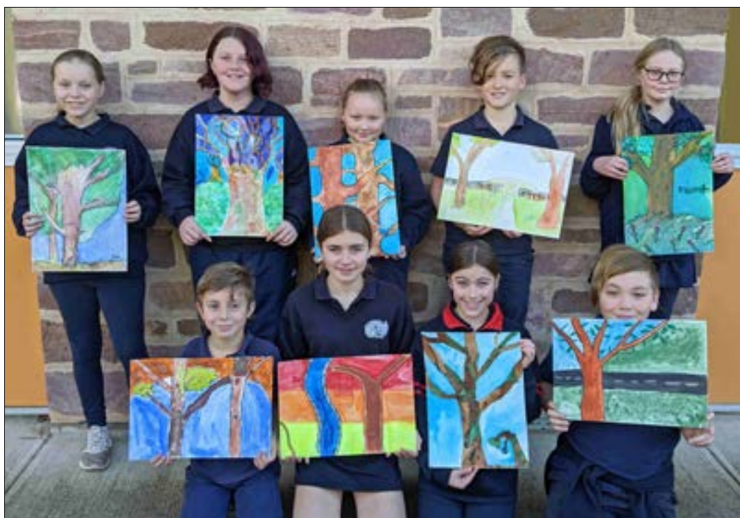
Year 5 and 6 students from the Woodside Primary School, with their Hills themed artworks. The school's "This is Us" SALA exhibition is at the Olive Branch Café, Balhannah, for the duration of the SALA festival.