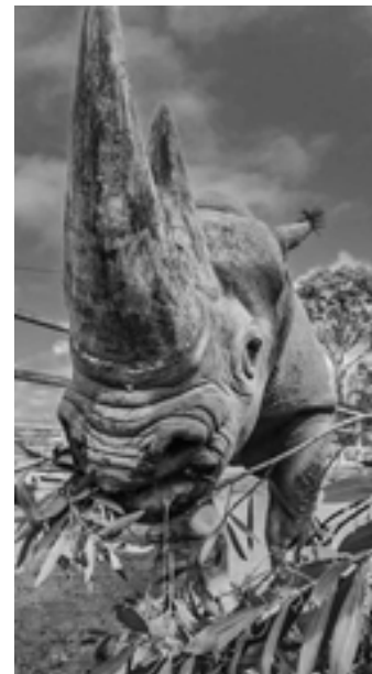
Black rhino at Monarto Safari Park eating browse foliage donated by the public.

sleep out in Autumn. All visitors require tickets, please visit Monarto's website for more information: www.monartosafari.com.au .