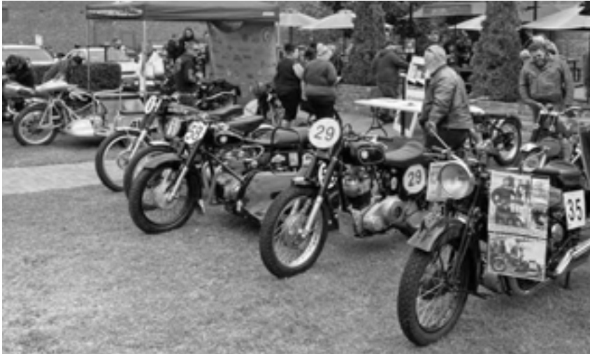
The inaugural Amberlight to Bierhaus Motorcycle Show & Shine, Sellicks Beach Historic Race display on the Lobethal Bierhaus lawn in 2021.

The Amberlight Motorcycle Café in Lobethal has been a traditional stop enroute since the early 1930s and on Sunday March 6th, riders will stop for longer than usual to partake in the 2022 Amberlight to Bierhaus Motorcycle Show & Shine.