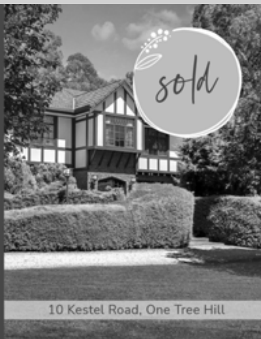
10 Kestel Road, One Tree Hill