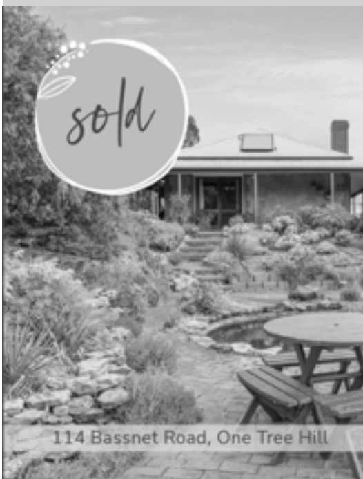
114 Bassnet Road, One Tree Hill