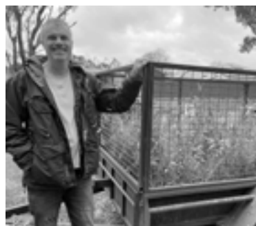
A happy landholder with his newly collected plants.