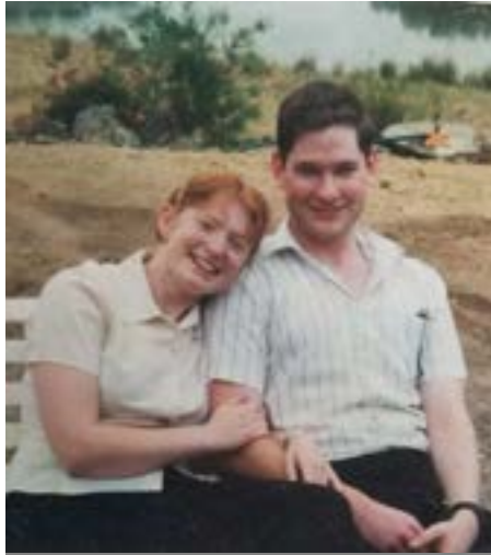
Lovebirds in 2000...