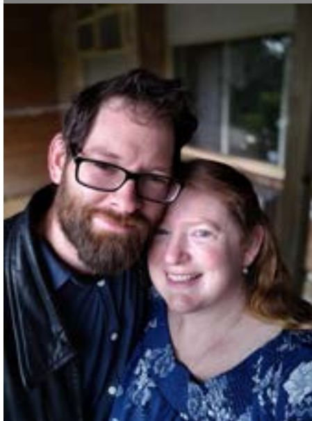
Lovebirds in 2022!