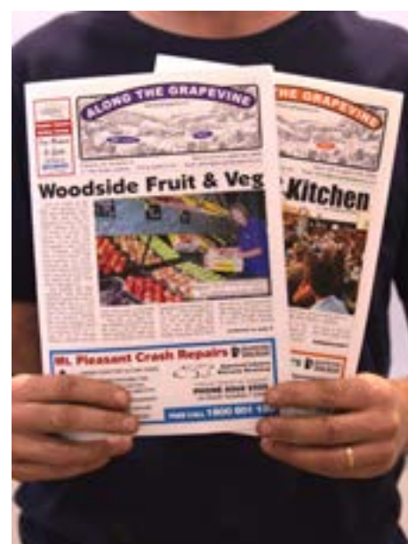
Our first editions with full colour photos on the front, printed in 2009.

That being said, Along the Grapevine has never been about making a lot of money. God has truly blessed us in the fact that most years we made a small profit, but over the past 3-4 years with Covid and other factors, it has declined to a point it just isn't financially viable. That being said, it has been my pleasure and privilege to have had the opportunity to serve the Adelaide Hills Community in this small way for the last 25 years!