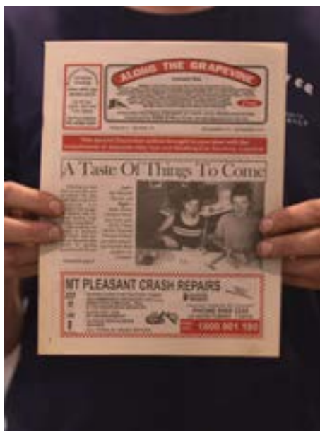
Our largest every edition, printed in 2000 - a whopping 40 pages!

I remember in the early days my dad telling me that I should go and cold sell advertising to businesses – people that I