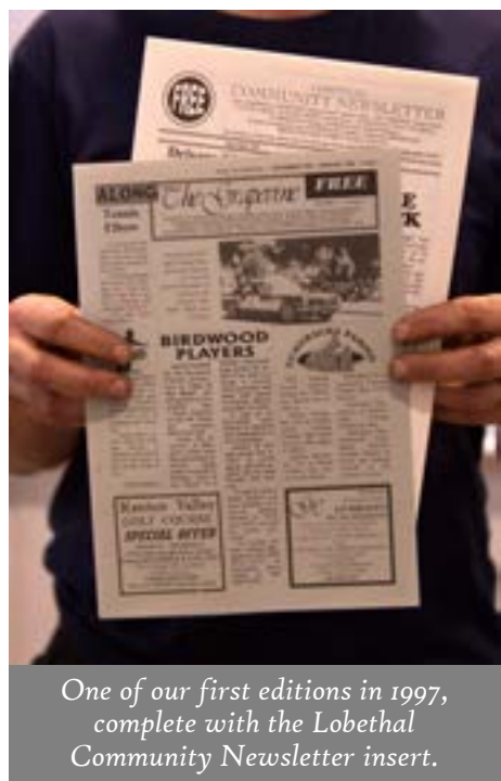
One of our first editions in 1997, complete with the Lobethal Community Newsletter insert.

Dad had the idea that we should go wider than just Lobethal, and distribute to a larger area of the Hills, so Along the Grapevine was created in October 1997. Our first few editions of ATGV were distributed with the Lobethal Community Newsletter, but it wasn't long before the two were combined and distributed across the Northern Adelaide Hills under the Along the Grapevine banner.